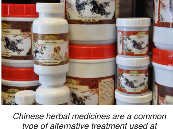
Chinese herbal medicines are a common type of alternative treatment used at PBEC.

Herbal, or botanical, medicine can be used to promote a horse's health and remedy a wide range of issues. The goal of Chinese herbal medicine is to treat the underlying cause of an issue and to encourage the body to heal itself instead of using synthetic medications that can only temporarily treat the symptoms.