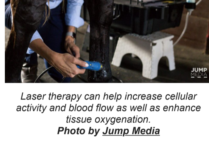
Laser therapy can help increase cellular activity and blood flow as well as enhance tissue oxygenation.

Laser Therapy is a safe, non-invasive treatment where a "cold" light is used to penetrate tissue structures. Laser therapy helps increase cellular activity and blood flow and enhances tissue oxygenation. Essentially, this treatment enhances the body's natural healing mechanisms to speed up the restorative process. There are four classes of lasers with different application protocols for power, duration, and wavelengths, and each one is used depending on the horse's individual condition.